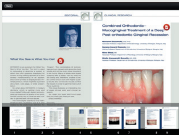
Fig 1 A screen shot of what you will be able to see on smartphones and tablets. You will be able to scroll to the article you want to read, as well as being able to send the title, author names and abstract to other people who might be interested in viewing the article.